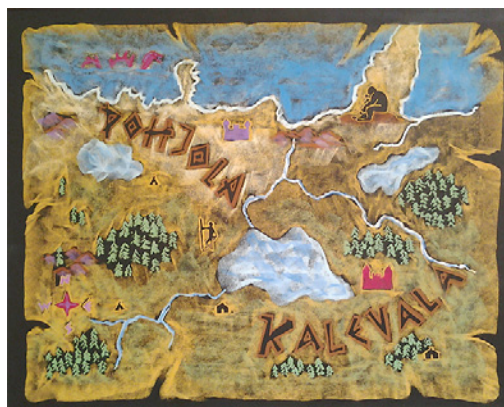
CHALKBOARD DRAWING BY ANNEMARIE GOSLOW